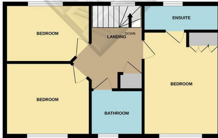
TOTAL FLOOR AREA : 1037 sq.ft. (96.4 sq.m.) approx.

Whilst every attempt has been made to ensure the accuracy of the floorplan contained here, measurements of doors, windows, rooms and any other items are approximate and no responsibility is taken for any error, omission or mis-statement. This plan is for illustrative purposes only and should be used as such by any prospective purchaser. The services, systems and appliances shown have not been tested and no guarantee as to their operability or efficiency can be given.